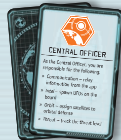
4 ROLE REFERENCE CARDS