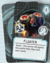
63 ENEMY CARDS