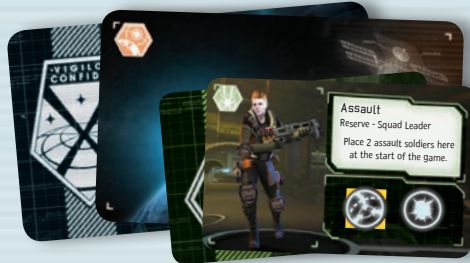
7 RESERVE CARDS (2 SIZES)