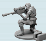
3 SNIPER SOLDIERS