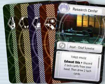
15 ASSET CARDS