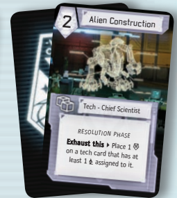
28 TECH CARDS