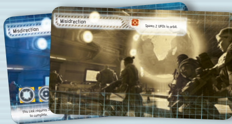
5 INVASION PLAN CARDS