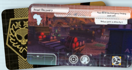
12 MISSION CARDS