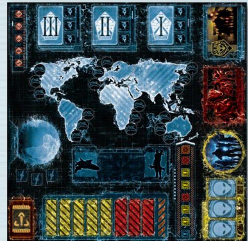
1 GAME BOARD