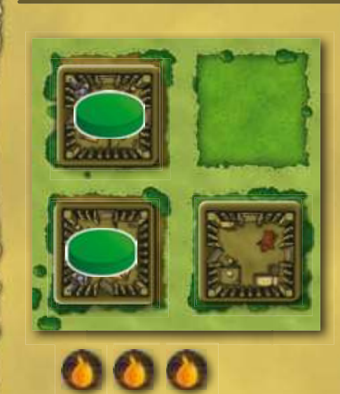
Example: Fraser has a 3-roomed Wooden Hut and 2 Family members. He must pay 3 Fuel to heat his Home (not 2, for his 2 Family members).

Farmyard spaces with Moor or Forest tiles are counted as "used".