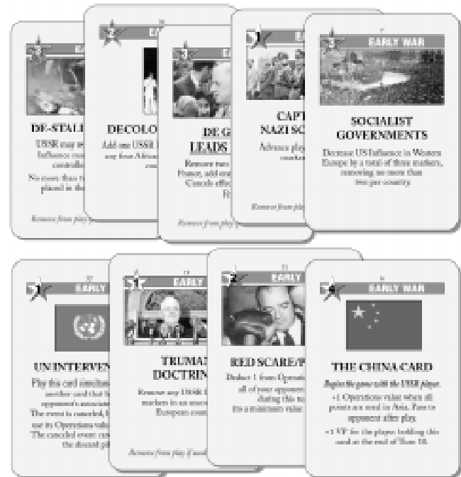
USSR Opening Hand

COMMENTARY: The US opts to lock down Japan from the get-go, ensuring no USSR efforts therein. The USSR hampers US activities for the whole turn with Red Scare, which reduces all Ops values on US cards this turn by one.