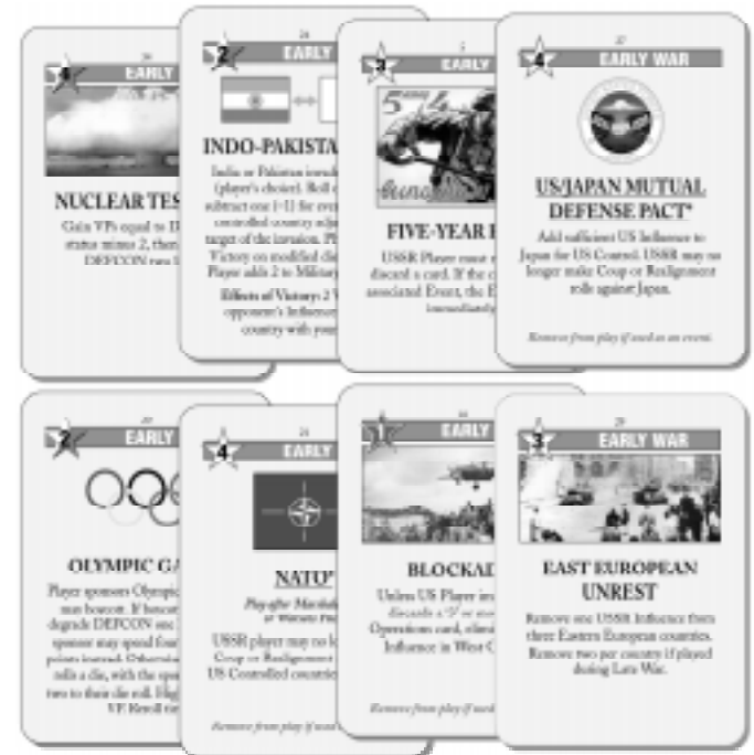
US Opening Hand