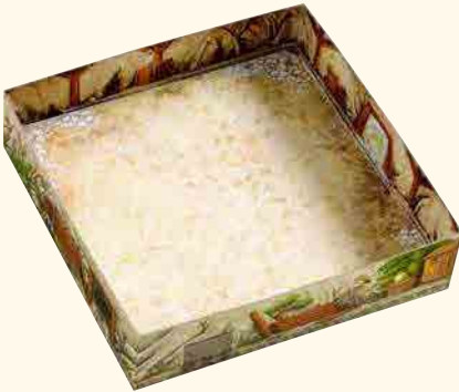
1 gold mine (box base with insert for explosion effect)