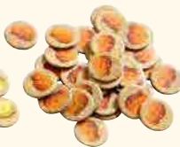
35x illegal gold nuggets