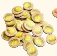
35x legal gold nuggets