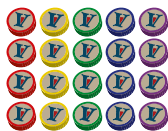
20 Influence Tokens