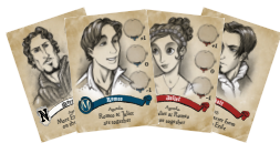
17 Character Cards